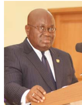
H. E. Nana Addo Dankwa Akufo-Addo

I am delighted to be here this morning at the investiture ceremony of an outstanding Ghanaian statesman, my former boss, His Excellency John Agyekum Kufuor, the 2nd President of the 4th Republic. It is entirely appropriate that he, who was responsible for ensuring that the Western University College of Kwame Nkrumah University of Science and Technology, through presidential assent on 12th November, 2004, became the University of Mines and Technology (UMaT), should be appointed as the first Chancellor of this University. Your Excellency, it is a well-deserved honour, given in recognition of the immense work you did, during your time as President of the Republic, not only for UMaT, but also for Mother Ghana. Ayekoo. I commend the authorities of the University for this admirable gesture.