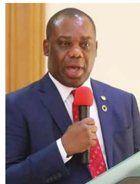
Dr. M. Opoku Prempeh

Your Excellency, President of the Republic of Ghana, Nana Addo Dankwa Akufo-Addo, Your Excellency Former President John Agyekum Kufuor, Colleague Ministers of State, Chairman of the University Council, Vice Chancellor, Members of Convocation, Students, Ladies and Gentlemen.